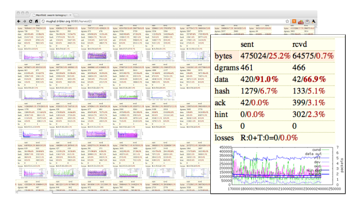
Fig. 2. The main N by N "harvest" spreadsheet (back) shows the big picture. Each cell (right) provides statistics on a flow.